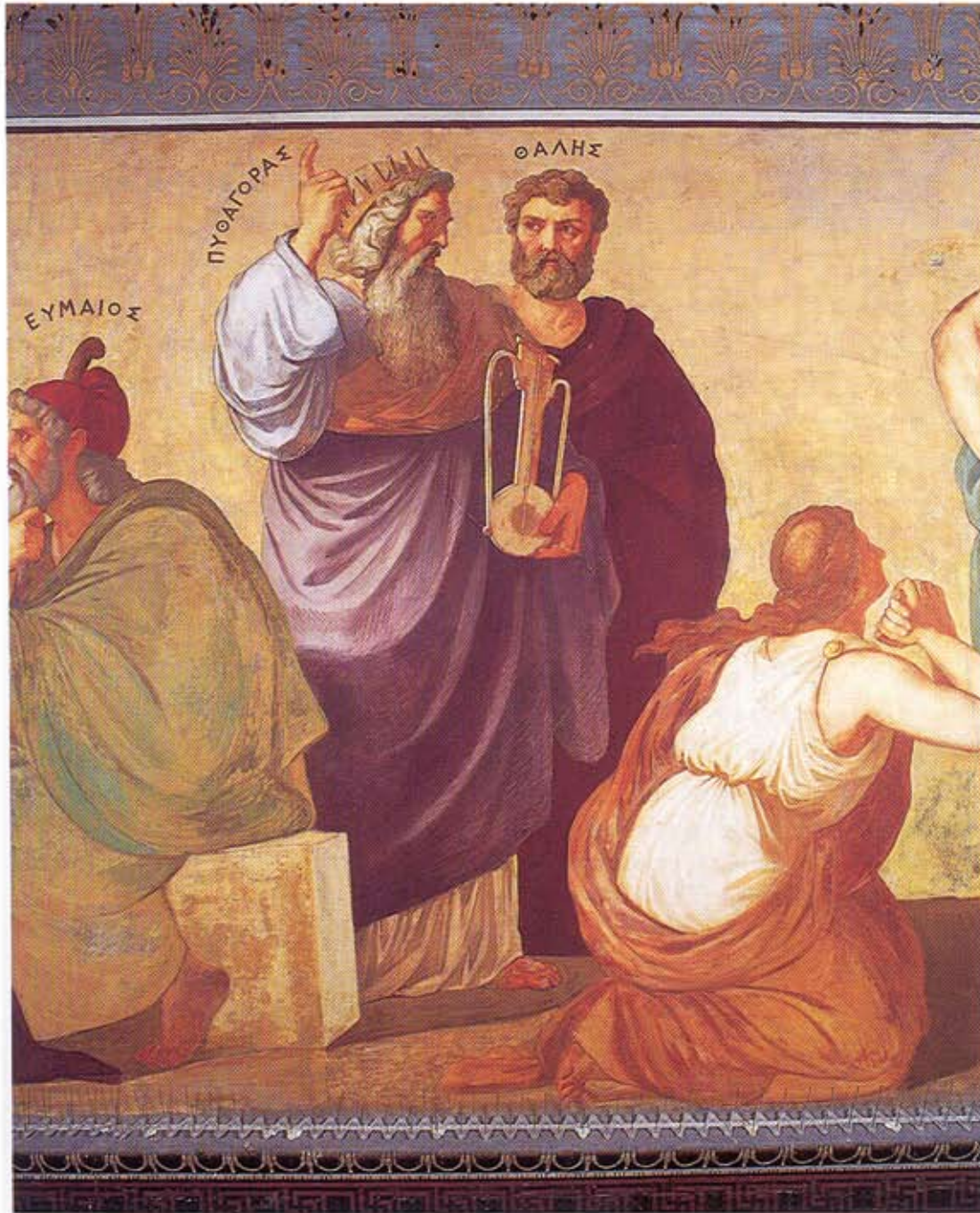
Pythagoras and Thales: Zophorus of the main entrance of the University of Athens